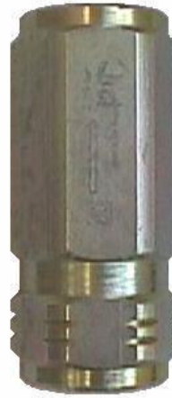
10305-048 (for identification)